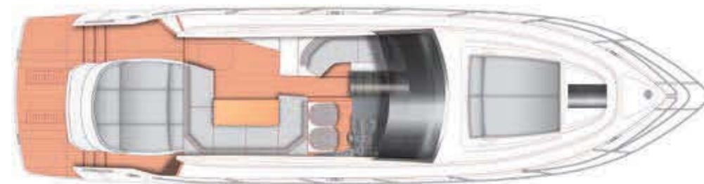
MAIN DECK - OPEN