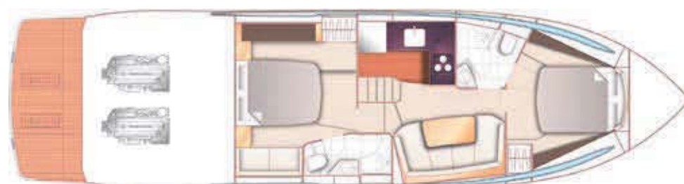
LOWER DECK - OPEN